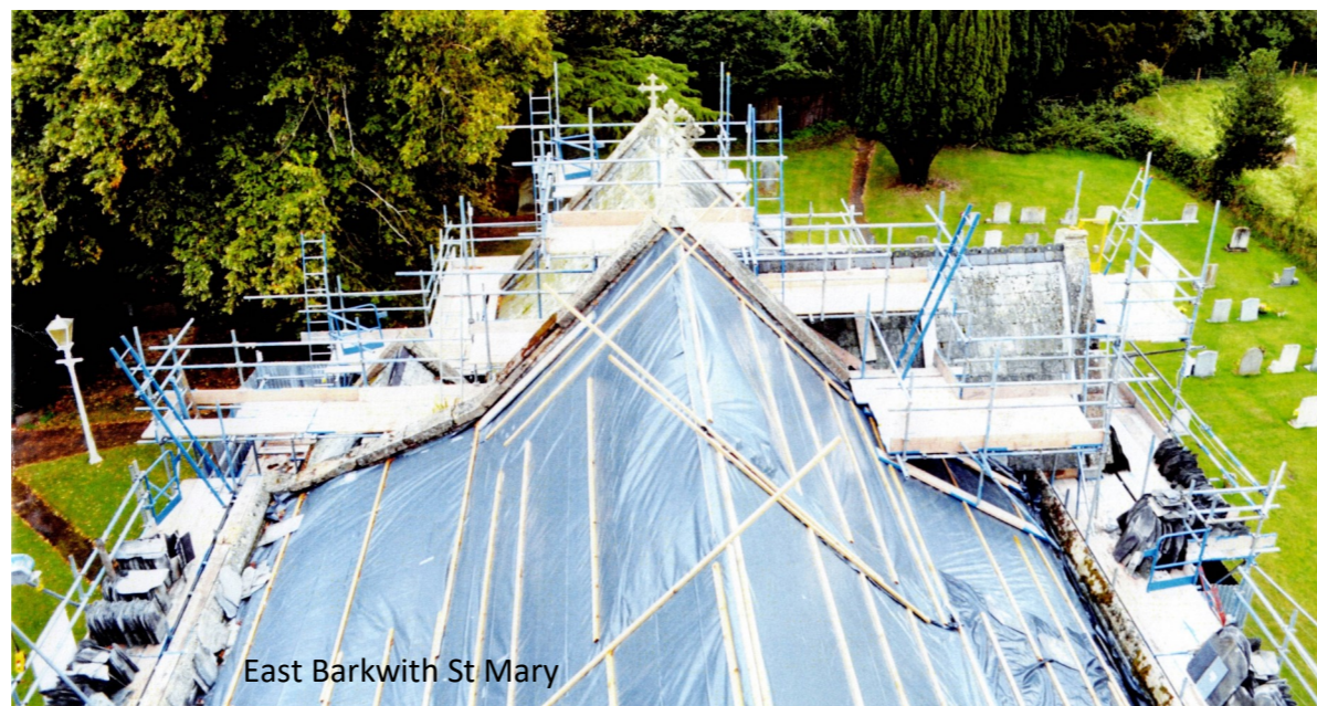
East Barkwith St Mary