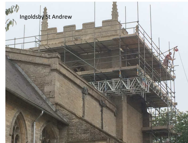
Ingoldsby St Andrew