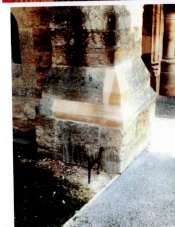
Swinderby All Saints. Assorted relatively minor fabric repairs to the wooden shingle roof on the lychgate and stonework repairs to the Porch. The work was completed in April 2012.