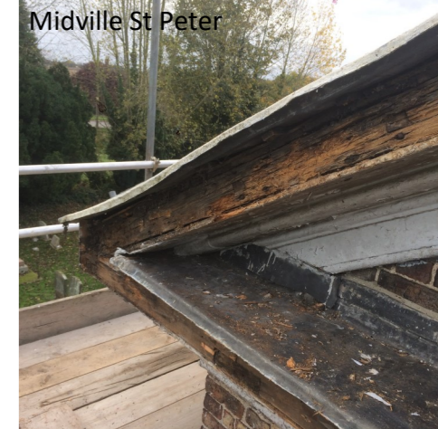
Midville St Peter