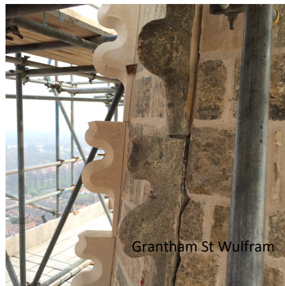
Grantham St Wulfram